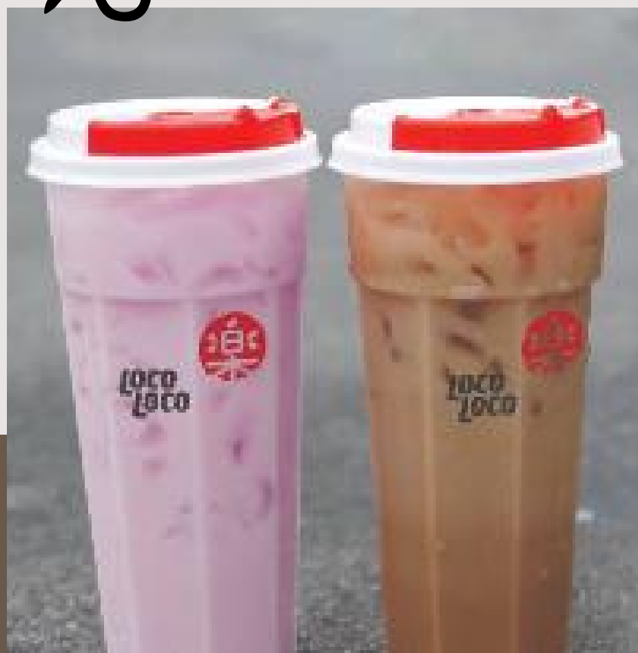
SAKURA MILK TEA

Minimum 2 hours of service at $500. (100 Cups) Additional hour of service at $250. (50 Cups)