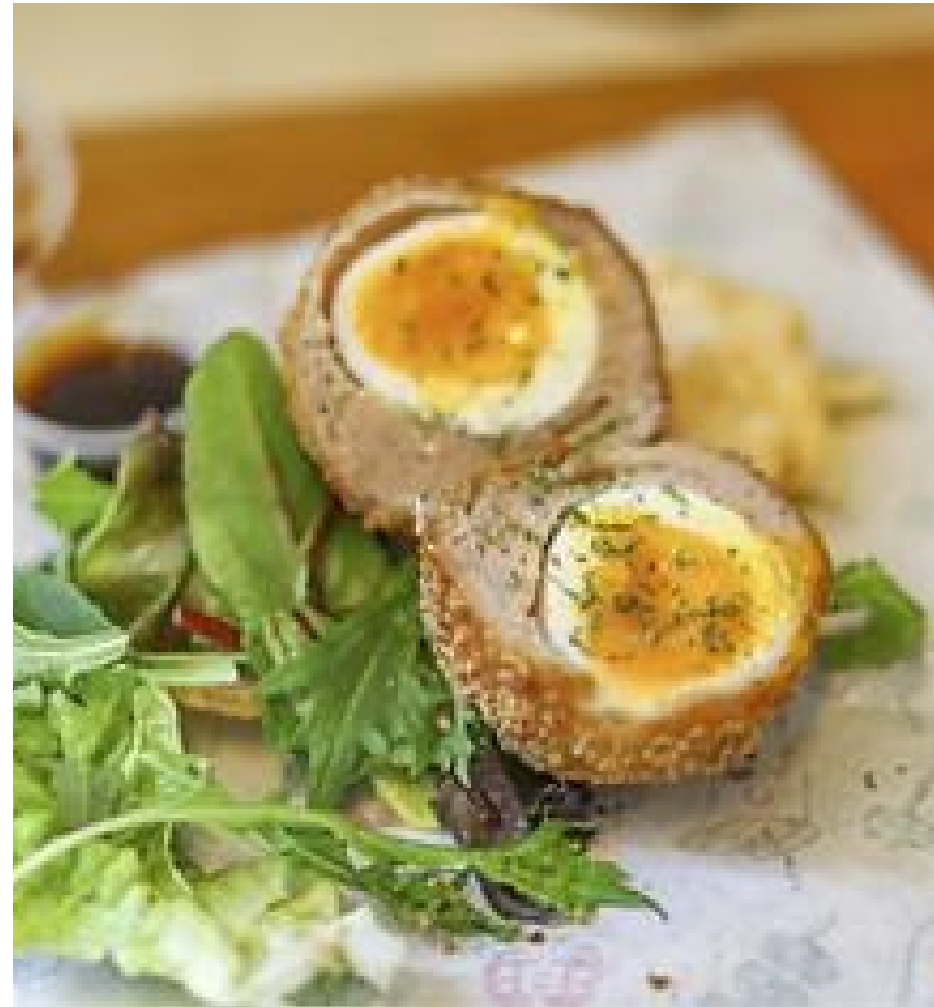
CHICKEN SCOTCH EGGS

Marinated with Loco Loco's special homemade sauces. Coated with breadcrumbs and cereal mixed.