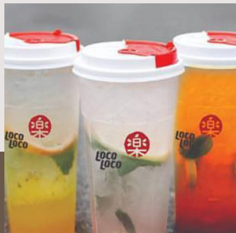
LEMON, LYCHEE, STRAWBERRY SODA