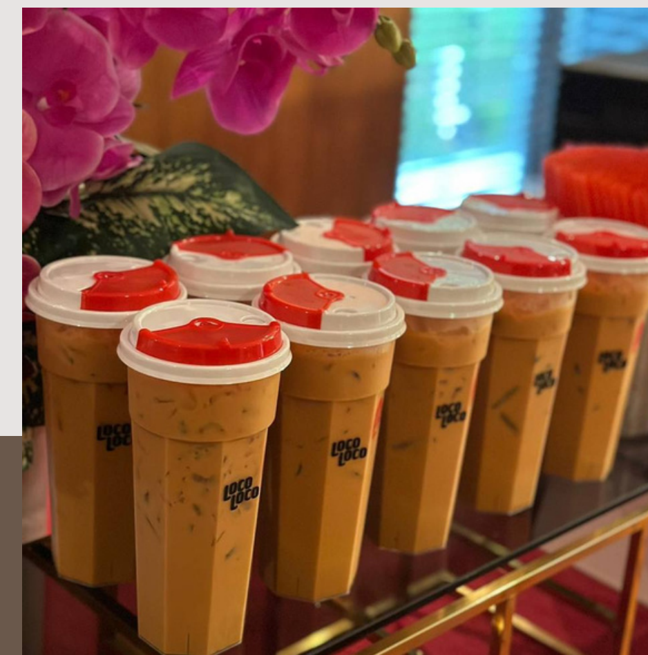
THAI MILK TEA