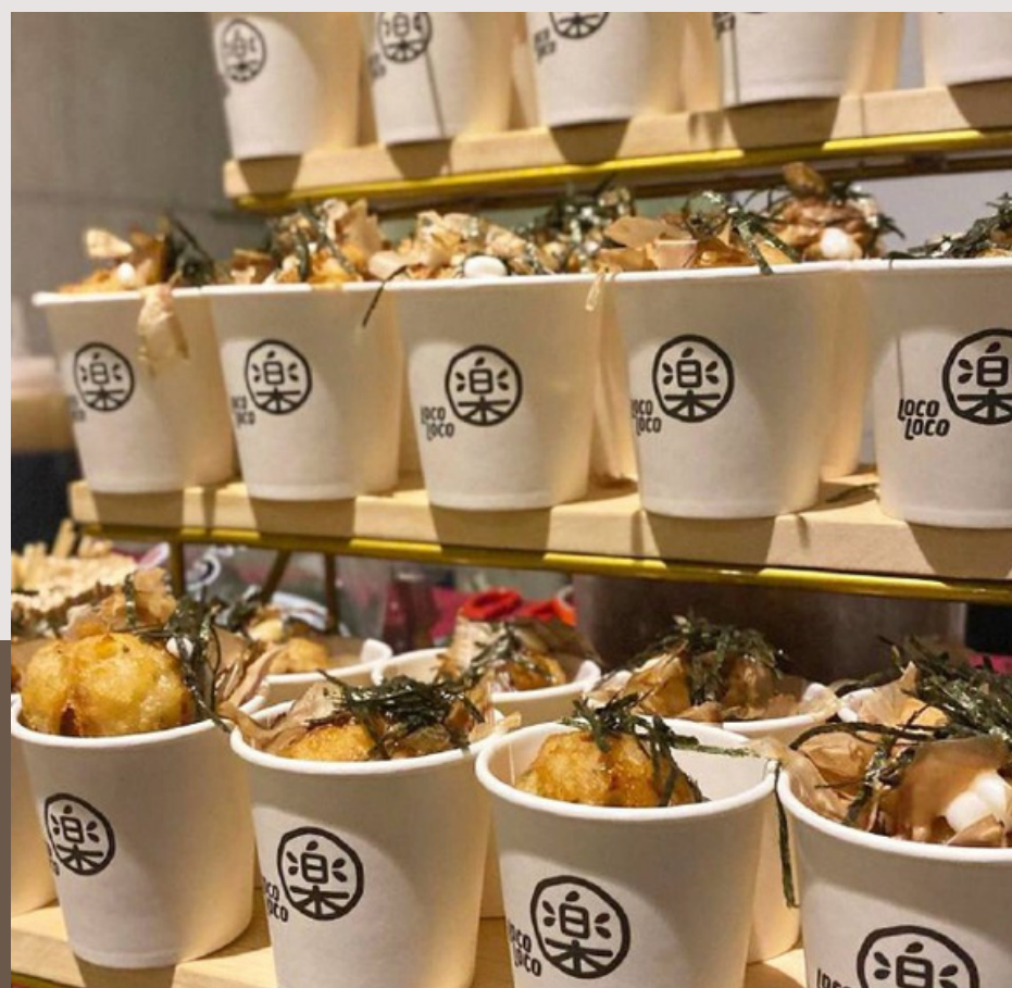
TAKOYAKI LIVE STATION

Minimum 2 hours of service at $550. (180-200 Cups) Additional hour of service at $250. (90-100 Cups)