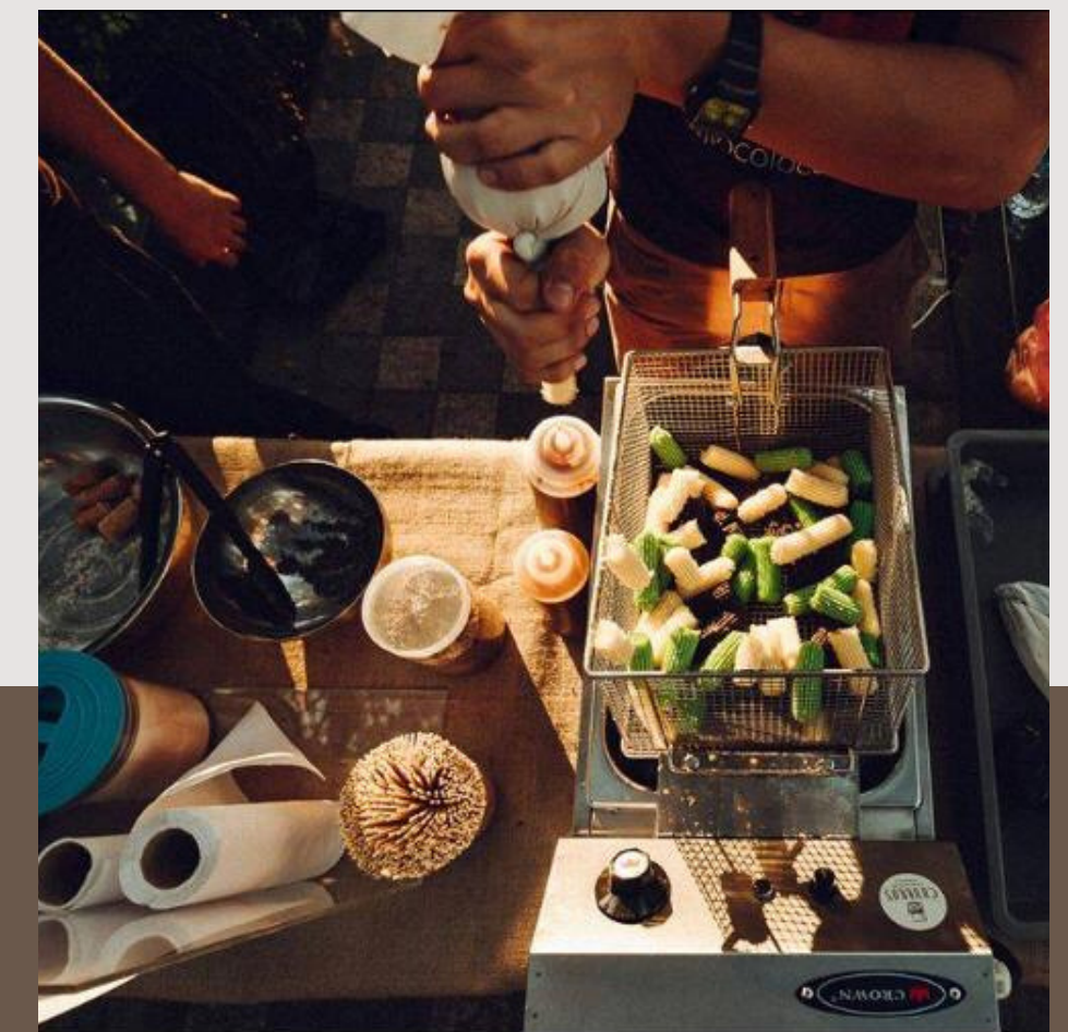
CHURROS LIVE STATION