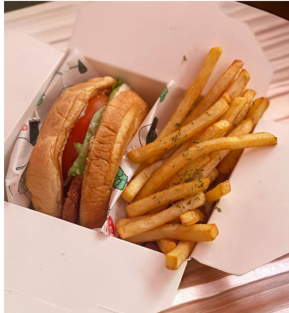
VEGAN BURGER WITH FRIES